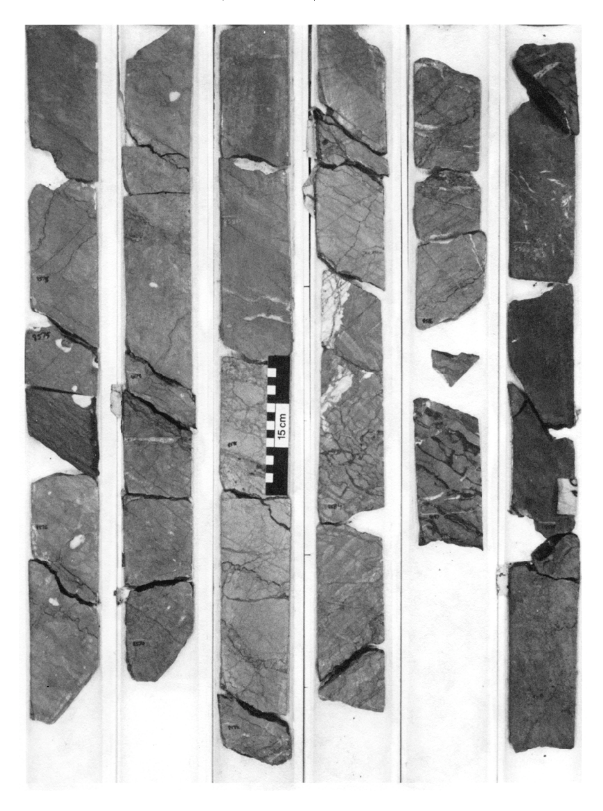
Plate I—Pure Oil Pruitt Unit No. 1 (8,573-8,589 ft).