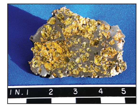
Figure 3—Polished section of a pallasite meteorite, believed to have originated from the core-mantle boundary of a planetary body. Note the greenish-yellow olivine crystals embedded in an iron-nickel alloy.

the surfaces of larger asteroids, planets, or moons. The irons and stony irons are thought to have come from the cores or core-mantle boundaries, respectively, of differentiated bodies such as planets and large asteroids that were massive enough to have produced a metallic core, a mantle, and a stony crust during their formation.