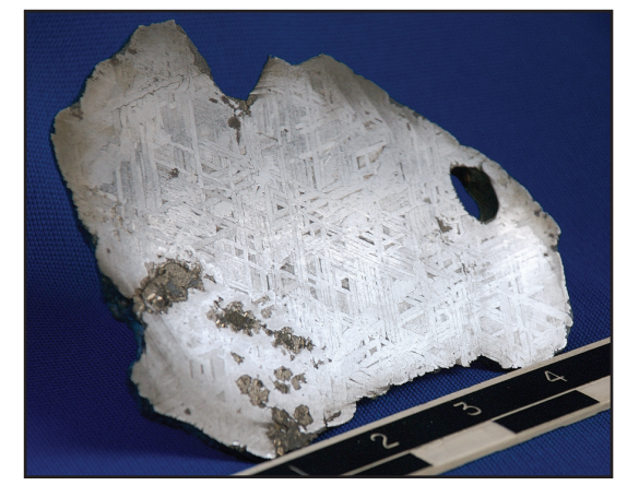
Figure 5—Polished section of an iron-nickel meteorite, showing Widmanstätten pattern.