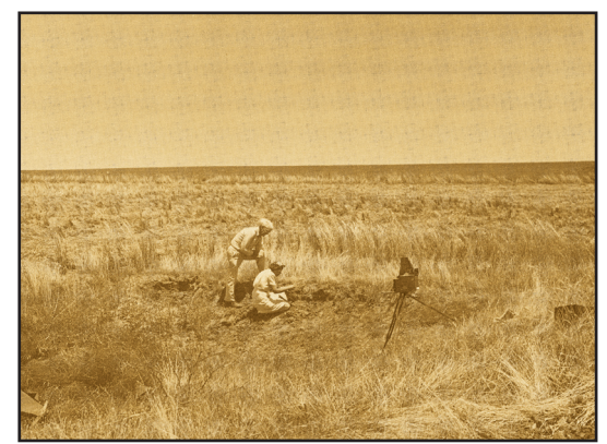
Figure 6—Clyde Fisher, of the American Museum of Natural History, and assistant, inspect the Brenham meteorite "crater." This is one of many Brenham landfall sites scattered over a large area.

of 2005, a specially designed metal detector located the largest piece yet from the Brenham site, a 1,400-pound meteorite. This latest large specimen is an oriented pallasite, a stony-iron body that remained oriented in one position as it fell, rather than tumbling, thus creating a rounded or conical