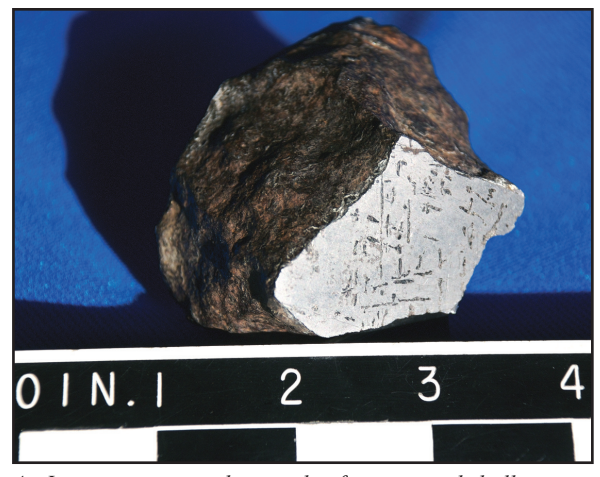
Figure 4—Iron meteorite made entirely of an iron-nickel alloy; note fusion crust and regmaglypts on outer surface. This type is believed to have originated from the core of a planetary body.

the surfaces of larger asteroids, planets, or moons. The irons and stony irons are thought to have come from the cores or core-mantle boundaries, respectively, of differentiated bodies such as planets and large asteroids that were massive enough to have produced a metallic core, a mantle, and a stony crust during their formation.