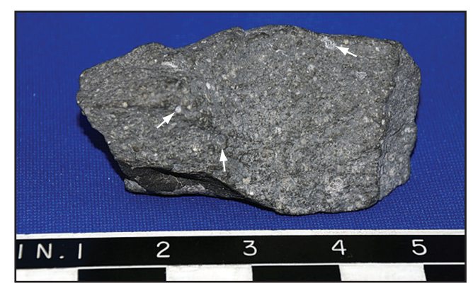
Figure 2—Carbonaceous chondrites, as shown here, range from gray to black and contain large amounts of carbon and organic compounds and also whitish calcium-aluminum-rich chondrules (arrows).

The majority of meteorites are believed to have come from asteroids. A few may have come from Mars, or the moon, or perhaps other solar system planets. In this scheme, the stony meteorites probably originated from undifferentiated asteroids or from