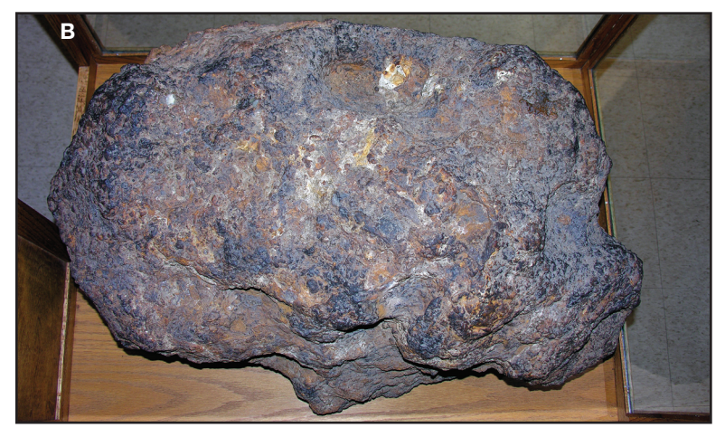
Figure 7—(A, left) Photo of 1,000-pound Brenham meteorite being hoisted from the ground by H. O. Stockwell and others in 1949. (B, above) Stockwell's 1,000-pound Brenham meteorite is on temporary display in the City Building on Main Steet, Greensburg, Kansas. Specimen is 21 x 32 inches.

shape on the side that took the brunt of the heat upon entering the atmosphere. Only two larger ones of that type are known to have been found in the world. All of the Brenham specimens are believed to have come from one meteorite that broke up during its fall. Scientists previously estimated that this fall occurred about 20,000 years ago, but recent evidence suggests it fell around 10,000 years ago. Over three tons of Brenham material have been found.