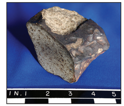
Figure 1—Photo of an ordinary chondrite. Chondrites contain chondrules, small spherical bodies believed to have originated during the formation of the solar nebula. Ordinary chondrites are rich in the mineral olivine and contain free metal up to 22% by weight. The metallic particles in this one have weathered to a rust color. The outer surface shows a fusion crust, regmaglypts (impressions that look like thumb prints), and rounded edges, all formed by frictional heating during atmospheric entry.

embedded in an iron-nickel alloy (fig. 3). Iron meteorites are made up largely of iron-nickel alloys (fig. 4). They are classified according to crystal structure and chemistry, including the percentage of nickel content. In etched and polished sections, many exhibit the characteristic Widmanstätten pattern of crystallization, as shown in fig. 5.